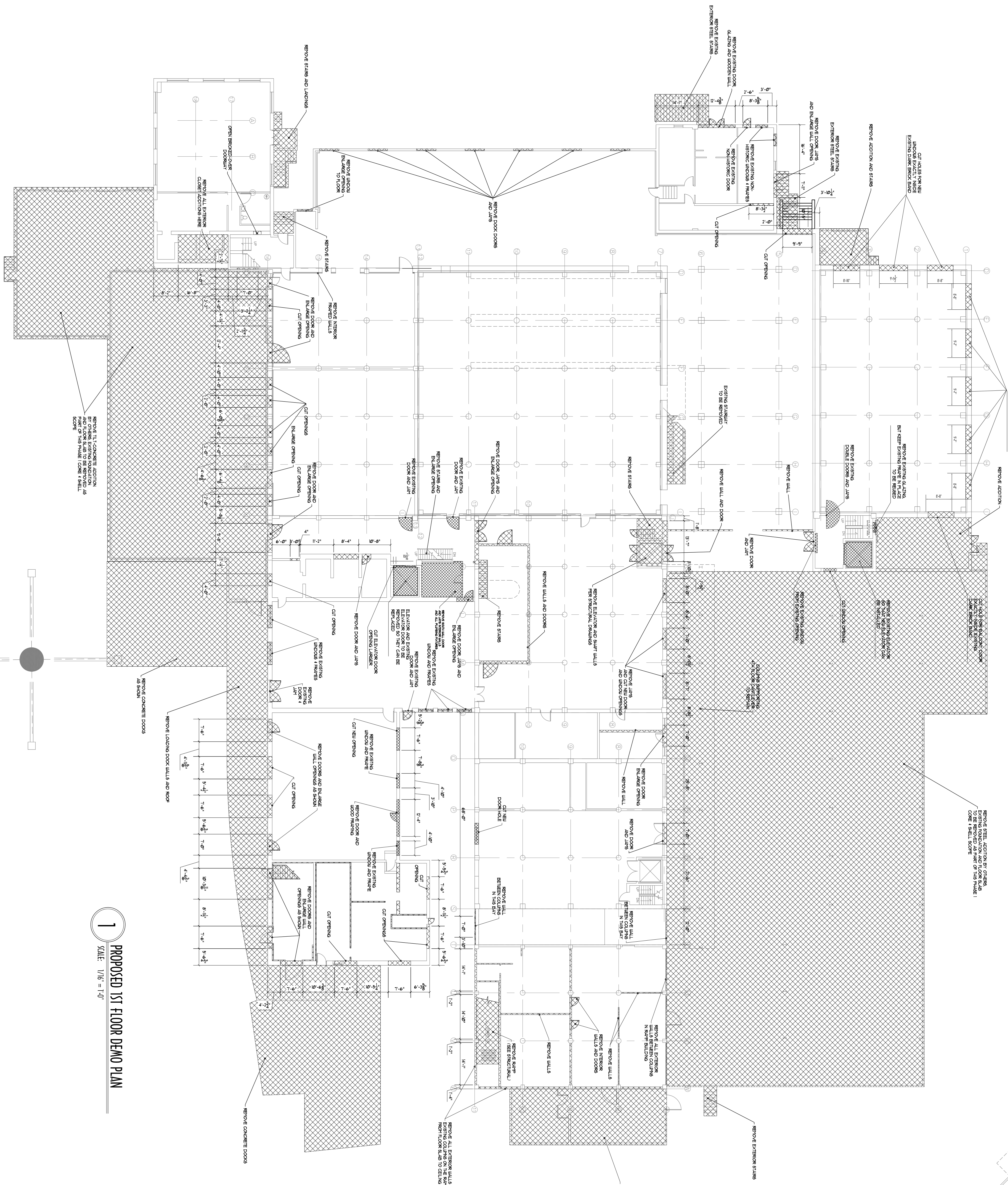
1 PROPOSED 1ST FLOOR DEMO PLAN SCALE: 1/16" = 1'-0"

EXISTING WALLS/AREAS TO BE DEMOLISHED IN PLACE REMOVE WALLS TO REPAIR AS IS